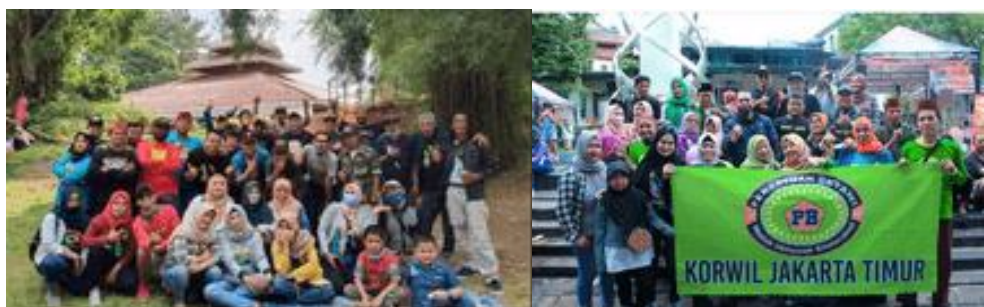
Figure 9. An Event Offline Meetings Photo

This study also found that activities carried out by members of the Persatuan Betawi virtual community were not only carried out online but also offline through face-to-face meetings. Community members regularly hold events which are attended by community members from various areas of Jakarta and outside Jakarta. Hence, the Persatuan Betawi virtual community is conducted by a hybrid base and makes the bonds between community members stronger. It can be seen from the upload in Figure 9.