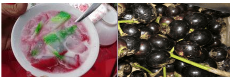
Gambar 7. Figure Typical Food (Es Selendang Mayang dan Buah Gohok)

Finally, He wears a black t-shirt, black sandals, green training pants, a black sling bag for Umrah, a plastic bag filled with clothes and a cellphone in a sling bag."