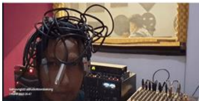
Figure 6. Relax In The Studio Photo.

"Hair is getting long while I read the posts and comments in this group. Just take it easy. Relaxed people always feel like they are at the beach. At Rawabelong Studios."