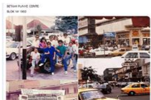
Figure 4. Nostalgia Photo

Apart from that, virtual communities are also often used in nostalgic conversations for members about conditions in Jakarta in the past; by talking about memories of the past, members feel that they get their happiness. It can be seen in Figure 4.