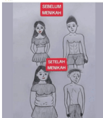
Figure 8. Differences Between Before and After Marriage Meme (Facebook: Facebook Persatuan Betawi, 2023)

Besides the upload above, the typology of excitement messages is also visible in postings that cause many reactions or make other community members excited, such as the following sentences: