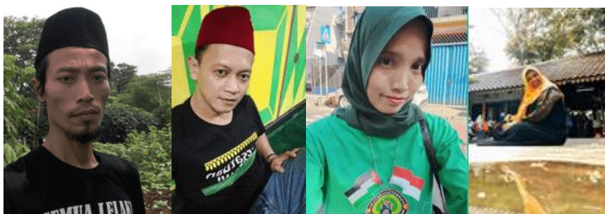
Figure 3. Self-expression carried out by virtual community members

"Assalamualaikum. It is not my intention to be arrogant or anything. Let us maintain our friendship. No need to battle and fight for fame here. We want to unite the Betawi people. What a shame. We should stop bullying, arguing, making enemies, hurting, elbowing each other, and harming other people. We should ask ourselves what we have done for our religion, our ulama, and Betawi. Please control yourself. If you remember something wrong, accept it and ask for apologize, and you should not buy something to be good, sadaqah does not make you poor, and introspection does not use expensive therapy. Have we done the right thing? Come on, get up. Remember, when you go to the grave, you will bring a shroud and charity only. However, do not feel you are the best, because no one knows whether they will get into heaven."