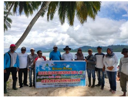
Figure 6. CHSE Socialization Activities on Cleanliness, Health, Safety and Environment Sustainability and the Beach Garbage War (Disbudpar, 2023)

Communities related to the development of marine tourism are social groups that do not have a structure that aims to develop tourism. Disparbud formed Tourism Awareness Groups (pokdarwis) in tourism development locations. But not all pokdarwis run as they should. Disparbud also provides English language training to Pokdarwis so that later they can become tour guides. The last training was held before the outbreak of Covid-19. Disbudpar also conducts socialization and education to the public to maintain the cleanliness of the beach as shown in figure 6.