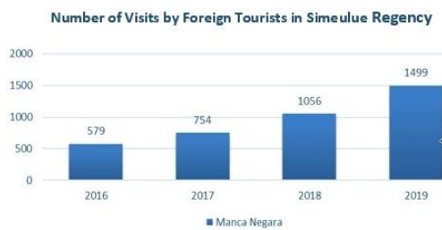
Figure 3. Number of Foreign Tourist Visits to Simeulue Regency from 2016 to 2019 (Disparbud, 2020)

Figure 2 explains that the number of tourists, especially from foreign countries, continues to increase. This is an opportunity that can be utilized by the Simeulue Regional Government in developing Sustainable Marine tourism.