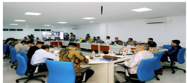
Figure 7. Meeting 8 Pj. Regent of South West Aceh at Teuku Umar University (Pakeh, 2022)

Academics are an important and quite strategic sector because this is where academics provide thoughts, ideas, ideas, which also act as tourism development consultants who come from certain tertiary institutions who know ideal theories and concepts. The preparation of a program should be carried out comprehensively, it is necessary to involve universities, such as the Acting meeting. Regents of South West Aceh facilitated by one of them by Teuku Umar University as a form of presenting universities, they are not executors but as experts to provide ideas, ideas and thoughts related to tourism development in Simeulue Regency.