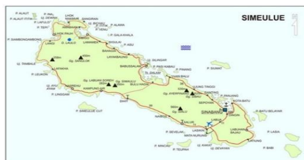
Figure 1. Map Of Simeulue Island (Nirwanudin, 2016)

Various marine tourism objects there provide great opportunities to improve people's welfare. The potential for marine tourism that currently exists starts from surfing, sailing, snorkeling, diving, recreation and so on. The coast in Simeulue has a high class and is included in international standards as an area suitable for surfing. The marine park that lies almost around the island is so promising. In addition, the condition of the coast on this island is clean, minimal waste and pristine, making tourists amazed by the beauty of the panorama.