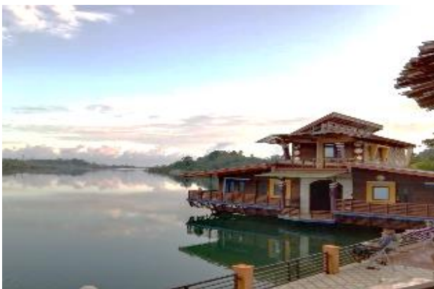
Figure 8. One of the lodgings in Simeule Regency is D'Fit Homestay ( dokumentasi penelitian 09 September 2022)

Business actors are parties who collaborate for the process of developing a program run by the government. Business actors in Simeule are engaged in lodging such as guest houses, home stays and resorts. However, there are no star-rated hotel facilities in Simeulue Regency, especially around the city. The resort ownership is private in nature which is scattered in several sub-districts such as West Teupah, Central Teupah and South.