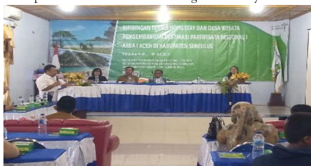
Figure 4. Homestay and Tourism Village Technical Guidance for the Development of Regional Tourism Destinations in the Aceh Area in Simeulue Regency in 2019 (Modus Aceh, 2019)

This training is given to tourism awareness groups and village communities and youth in tourism development in Simeulue Regency so that they can work together with the government to develop sustainable natural resources through tourism. In addition, training was also provided to tourism business actors, especially owners of guesthouses, resorts and home stays in Simeulue Regency. One of them is the Bimtek on Homestay and Tourism Village Development which was organized by the Disparbud together with the Ministry of Tourism in 2019 which was attended by 40 participants from both business owners and also representatives of the tourism village community.