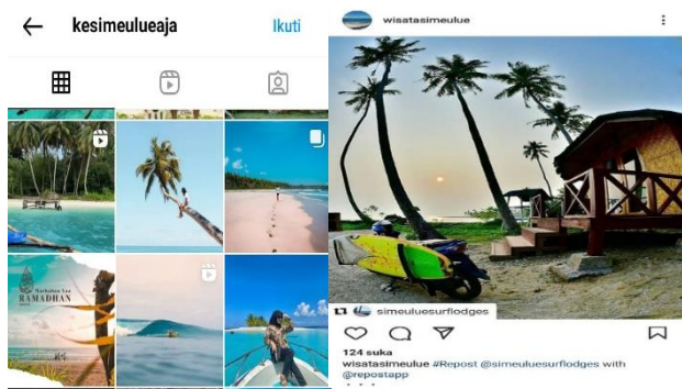
Figure 5. Instagram media that participates in promoting marine tourism in Simeulue

Several social media have helped the Simeulue Regency government to promote Simelue marine tourism including the Kesimeulueaja IG account, Wisatasimeulue as shown in Figure 4.