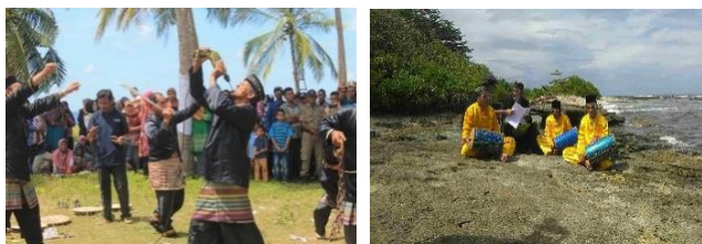
Figure 10. Simeulue Nandong and Debus Cultural Arts

Nandong is the art of speech through chanting poetry or rhymes about advice, morals and expressions (Nasution, 2018). In addition, there are other cultural arts such as Smong Nafi-Nafi sayings or stories that contain tsunami disaster mitigation (Kurniawan, 2022) and Debus as shown in Figures 10.