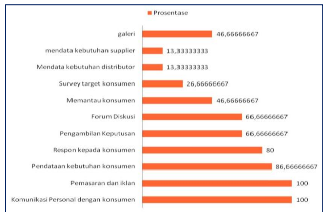
Figure 2. Benefits of Using Social Media in the City of Mataram in 2020.

The figure 2 below shows the use of social media as a tool for promotion in the city of Mataram.