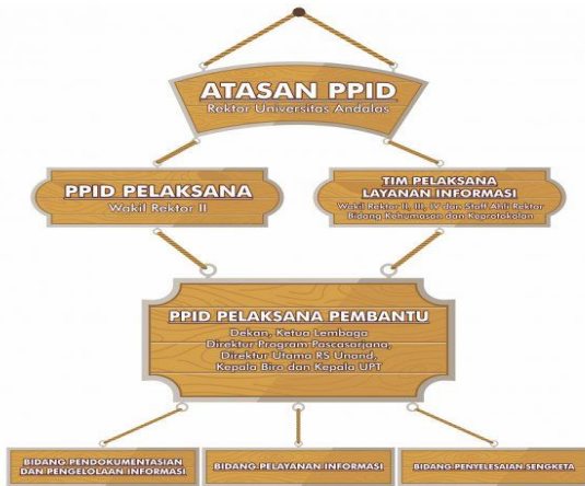
Figure 1. Organizational Structure of PPID UNAND

The organizational structure of PPID unand is based on information on the official UNAND website.