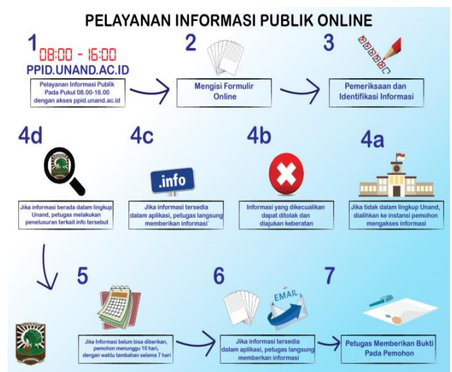
Figure 2. Procedure for Online Information Request

Seeing the implementation of information disclosure in a government agency or institution can be seen from the public information service system in a Public Agency by information service standards based on applicable rules. Information services at Andalas University have also made it easy for the public to get information about Andalas University easily and quickly, using the public being able to submit information managed by Unand with applicable terms and conditions. Andalas University provides information services online as well as offline.