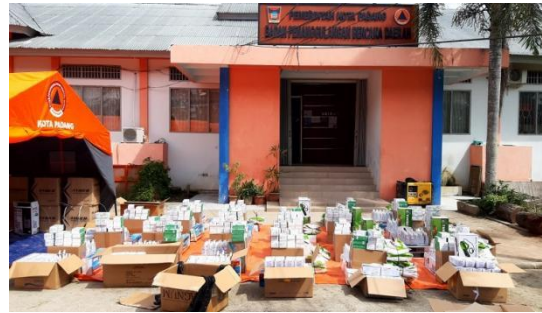
Figure 2. Distribution of PPE to related agencies.

relevant agencies to accelerate disaster management activities. This can be proven through the following photo documentation: