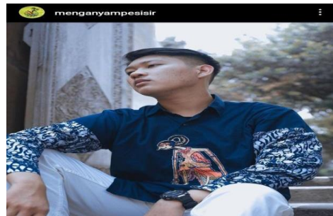
Figure 4. Batik products

In terms of marketing, Penganyam Pesisir has produced some products to be marketed, such as batik, jewelry, bags, woven mats, and so on.