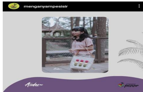
Figure 5. Bag Products

The two products above are the result of the production of the people of Gunung Kidul after receiving direction and training from the Menganyam Pesisir team. Products like this are marketed through social media, such as Instagram. Product photos uploaded on the Instagram page are supported by captions or descriptions of product sales, as follows.