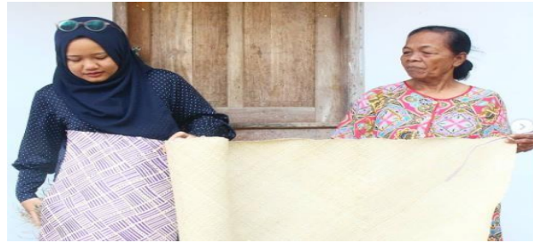
Figure 2 Mentoring