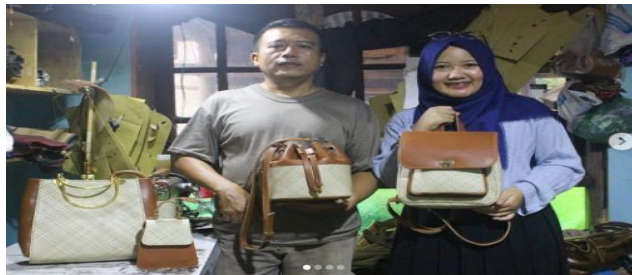
Figure 3. Entrepreneurship

Based on Figure 1, Figure 2, and Figure 3, it can be seen that the Menganyam Pesisir team carries out three programs based on social entrepreneurship. First, in the skill training program, the Menganyam Pesisir team guides women in processing pandanus, weaving, making accessories, and making products. Second, in the mentoring program, the Menganyam Pesisir team provides ongoing assistance and monitors the progress of the skills that have been carried out. Third, in the entrepreneurship program, the Menganyam Pesisir team shows the results of the crafts that have been produced. At this stage, the craft product is ready to be launched and ready to be sold.