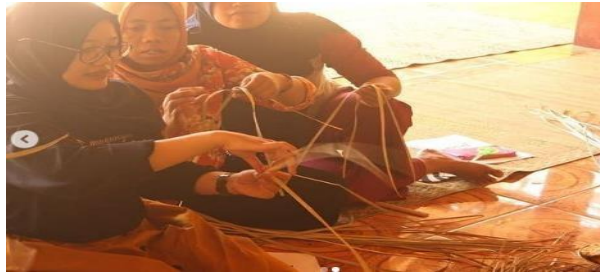
Figure 1. Skill training